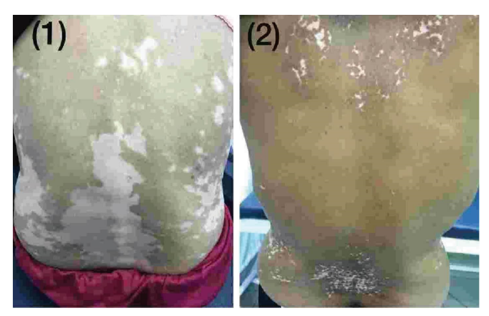
FIGURE 3: Back of a female vitiligo patient from group (A). (1) before treatment and (2) six months after treatment with NB-UVB plus minipulse prednisolone.

TABLE 1: Tissue levels of MIF among the study groups and tissue levels of MIF among the included patients in terms of response to therapy.